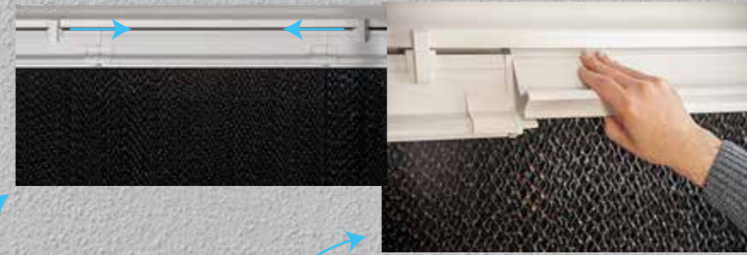
For Easy Pad Replacement