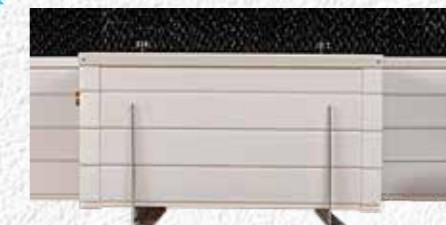
Water Tank With Float