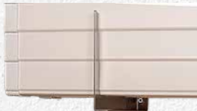
Stainless Steel Bracket