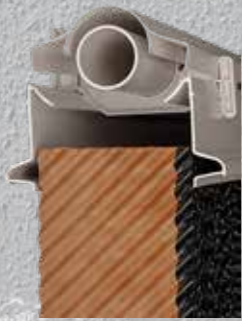
60 mm Water Distributon Pipe