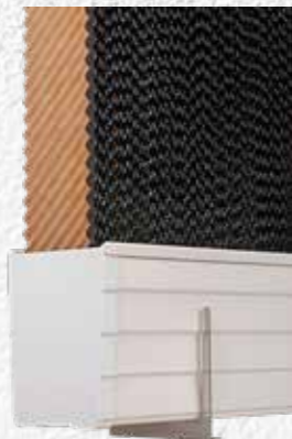
End Cover For Water Gutter