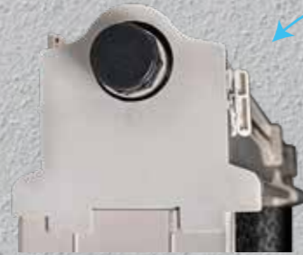
End Cover For Deflector