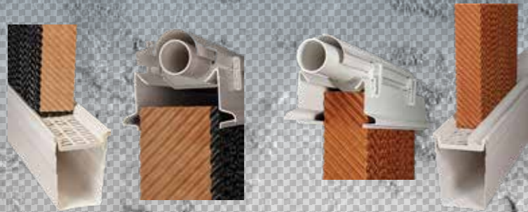
15 cm Thickness